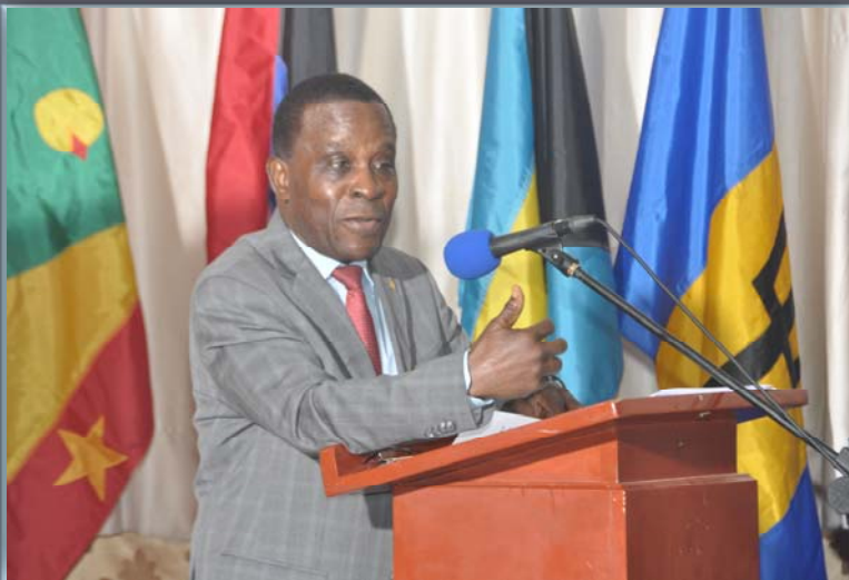
Dr. The Rt. Honourable Keith C. Mitchell Prime Minister of Grenada

“We could do a lot more. I strongly believe that regional economies could have been far more advanced in terms of sustainable development had we adequately invested in our statistical systems to obtain data required for more effective decision-making”.