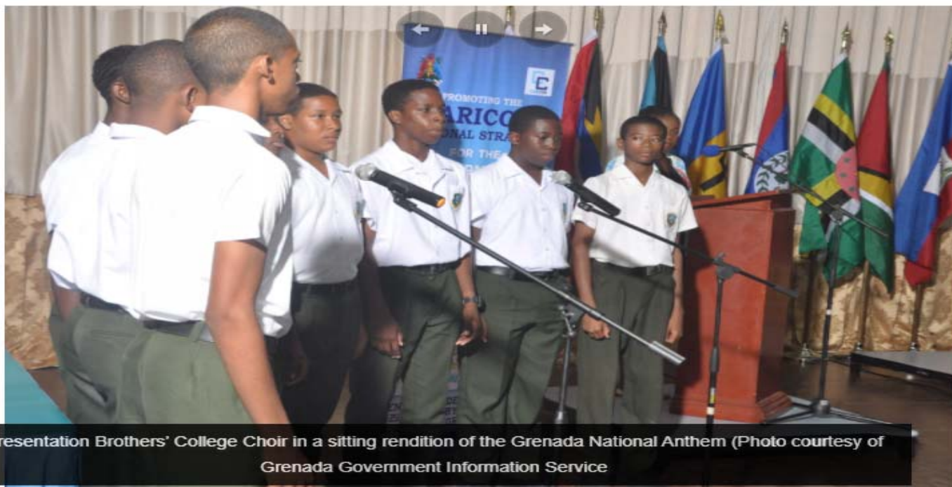
Presentation Brothers' College Choir in a sitting rendition of the Grenada National Anthem

In recommending the need for a strategic approach to Statistical Literacy, the PM stated that this can be improved by incorporating statistics in the school system, particularly from the secondary level as well as including specific courses in statistics at the A' Levels (Caribbean Advanced Proficiency Examinations, CAPE) in addition to the pure mathematics or mechanics that are currently being offered in the region.