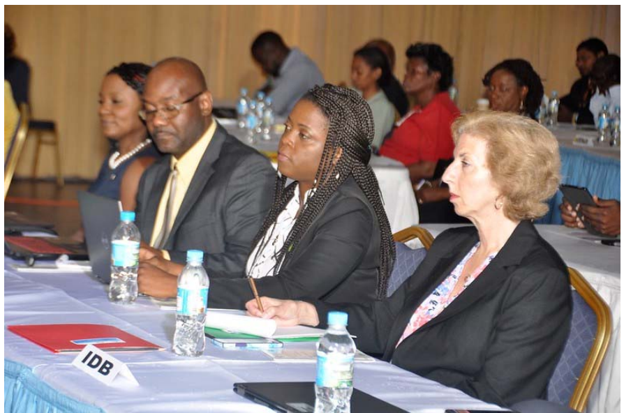
Delegates during the Opening Ceremony at the Grenada Trade Centre