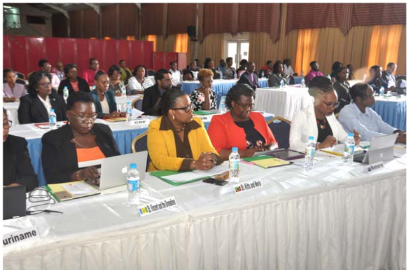
Participants at the High Level Seminar

The CARICOM High Level Seminar on Statistics was successfully convened prior to the Third HLF on the 21 February 2019 . The seminar centered on a few core issues of the strategic Framework of the CARICOM RSDS that will influence its success in enabling its goal of an efficient CARICOM Statistical System (CSS) , that is responsive to the national, regional and global development agenda, enabling a resilient Community with sustained economic growth and development.