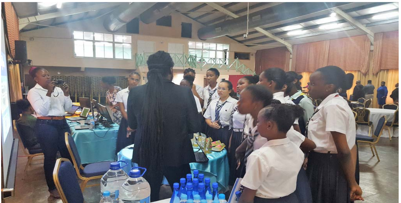
Students engage in discussions with an exhibitor during the IT Fair