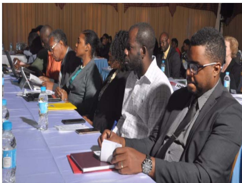
Delegates during the Opening Ceremony

Dr. Harrison also stated that the Third High Level Advocacy Forum on Statistics that was being hosted by the Right Honourable Prime Minister and the Government and people of Grenada is a watershed moment in its thrust to build on the momentum of the high-level endorsements given to statistics.