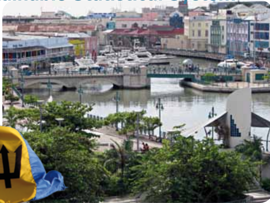
Bridgetown, the Capital of Barbados