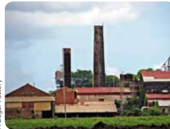
A Sugar Factory