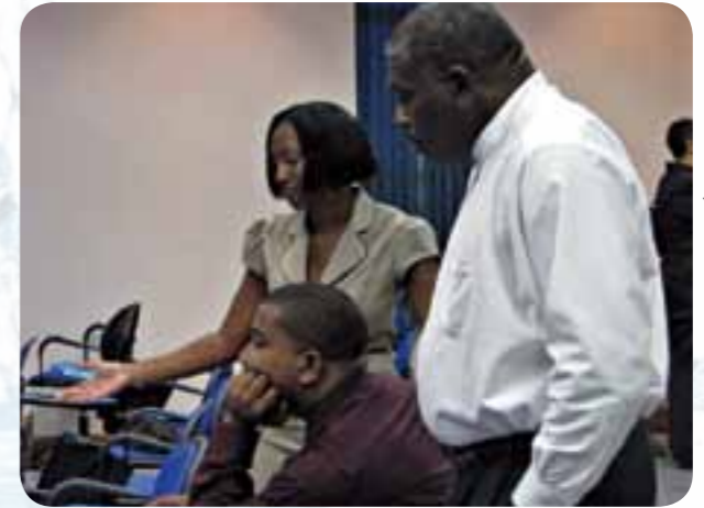
Staff of the BSS, working on the development of "BimInfo", a statistical database