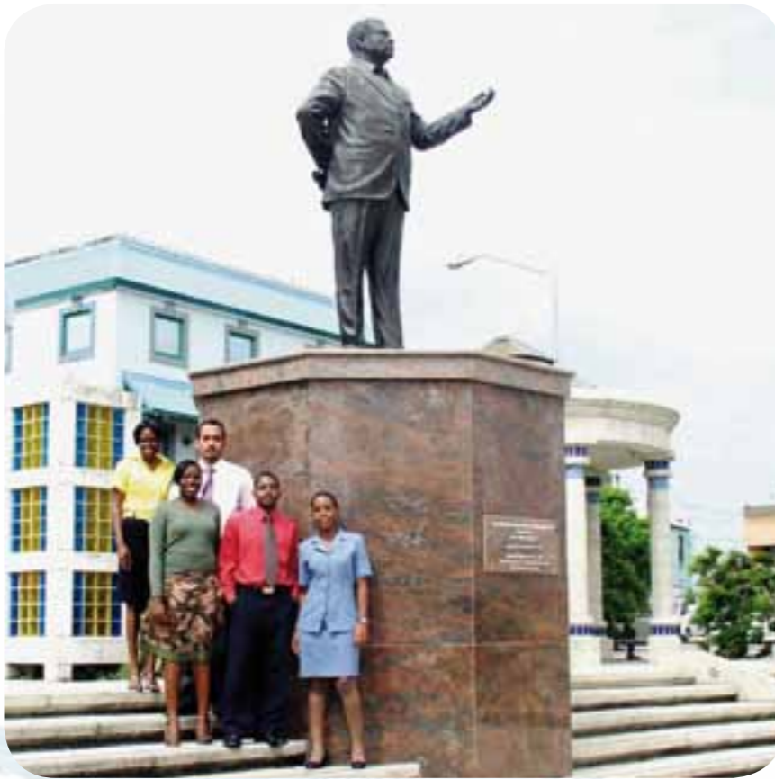
Independence Square, staff of the BSS beside statue of the Rt. Excellent Errol Barrow, 1st Prime Minister and National Hero

Timely and reliable statistics inform decisions made by the public sector, the private sector and by the general public. In order to achieve the vision for Barbados, it is necessary to provide an adequate framework for the production and dissemination of statistics