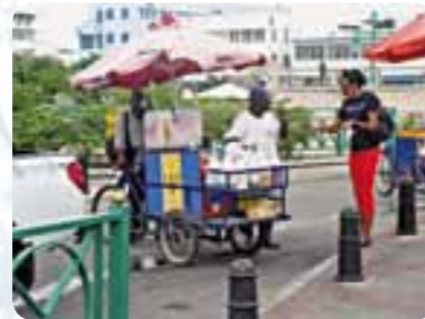
Representative of the Informal Sector: Snowcone Vendor