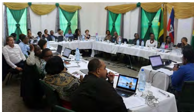
Participants in session during 43rd SCCS Meeting

The core SDG Indicators available and produced by Member States will be collected by the Secretariat. It was also noted that the Secretariat would seek funding for capacity-building on the core SDG indicators that are available but not currently produced or not available/not produced in countries. The SCCS commended the work of the TWG-SDGs and the CARICOM Secretariat on the identification of the core SDG Indicators. It is expected that the work of the TWG-SDGs will be fundamental in providing the technical support that would be required on the developmental activities.