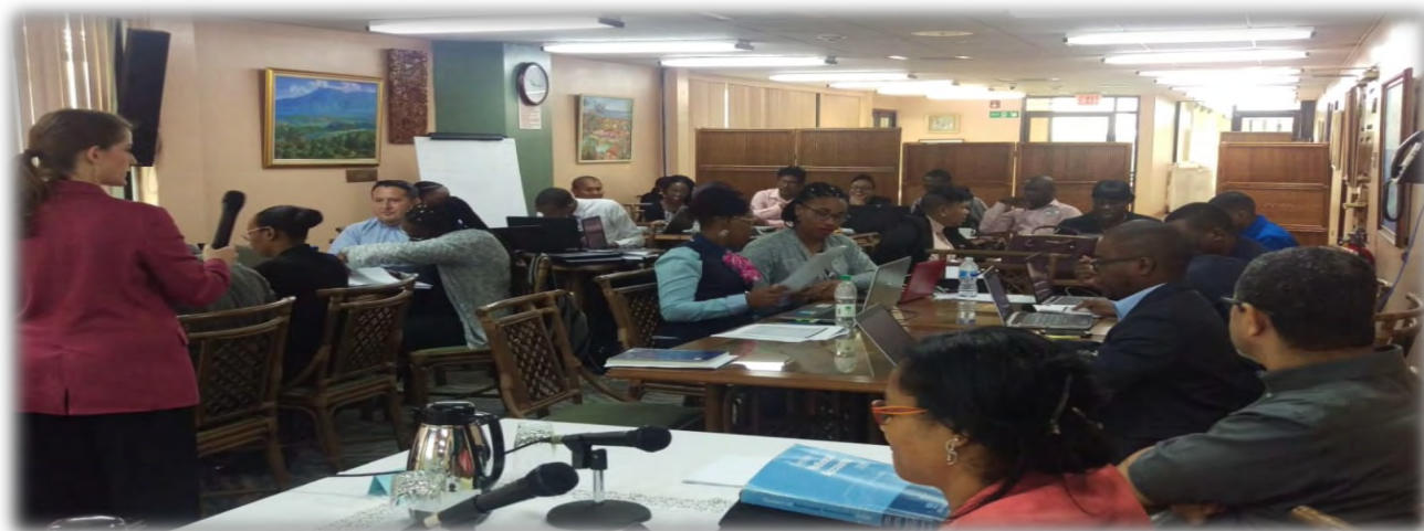
Participants at the Regional Workshop on SDG Indicator 2.a.1 at the CARICOM Secretariat

The Caribbean Community (CARICOM) Secretariat in collaboration with the Food and Agriculture Organisation of the United Nations (FAO) convened the Regional Workshop on Sustainable Development Goals (SDG) Indicator 2.a.1—Agriculture Orientation Index for Government Expenditures during the period 22-24 May 2019 at the Secretariat Headquarters in Georgetown, Guyana.