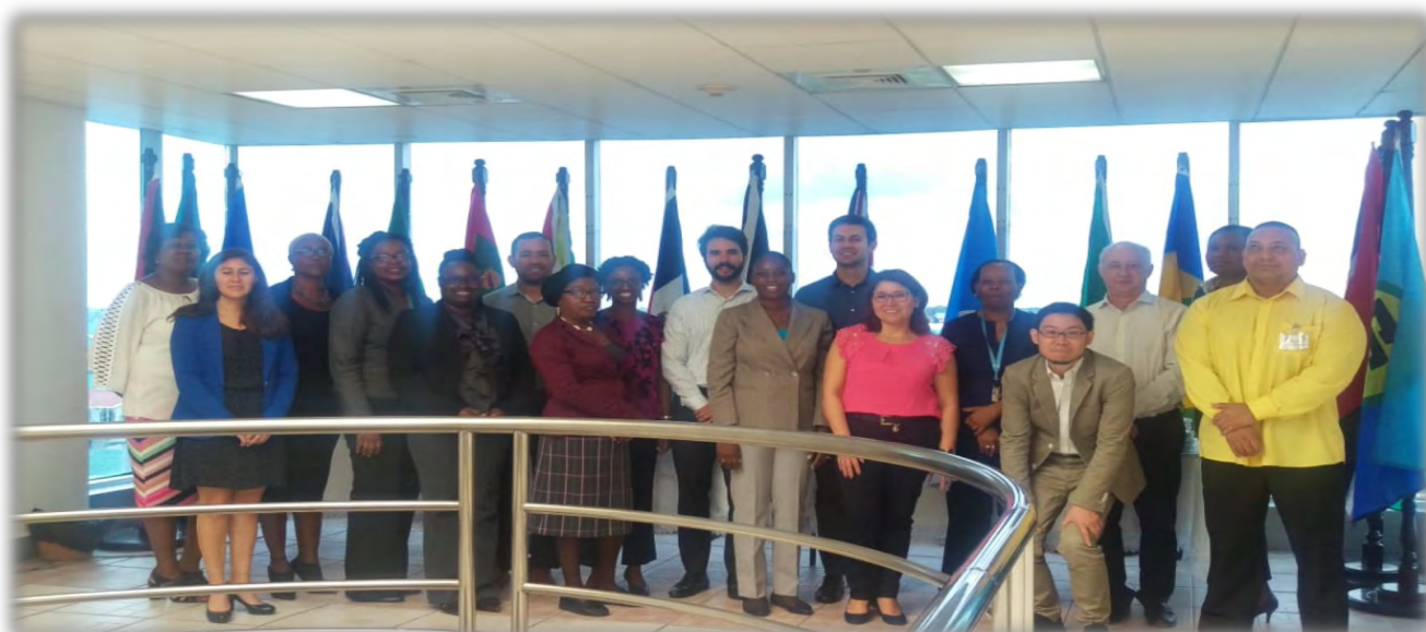
Participants at the ICP Technical Meeting at the CARICOM Secretariat

The United Nations Economic Commission for Latin America and the Caribbean (ECLAC) in collaboration with the Caribbean Community (CARICOM) Secretariat organised a Technical Meeting in the Framework of the 2017 Round of the International Comparison Programme (ICP) at the CARICOM Secretariat, Georgetown, Guyana on 10-14 June 2019.