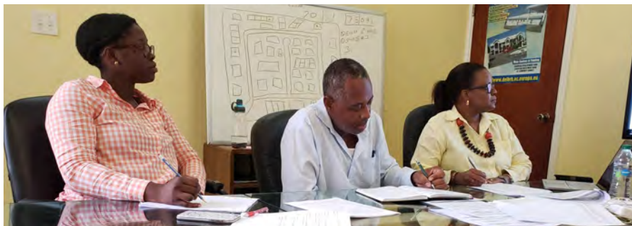
Participants from St. Kitts and Nevis during the remote meeting

The Caribbean Community (CARICOM) Secretariat convened the First Remote Meeting on the CARICOM Quality Assurance Framework on Friday, 21 st June 2019 .