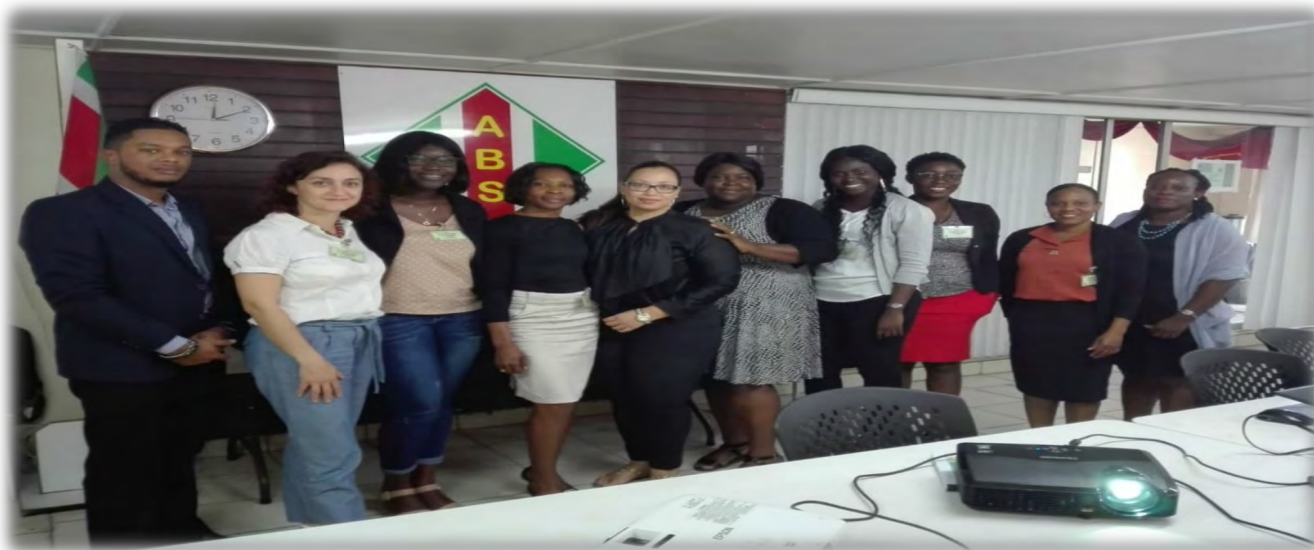
Participants at a Country Assessment in Suriname, April 2019

CARICOM has received support under the Project, Capacity-Building for Statistics which is being funded by the Government of Italy through the Italian Agency for Development Cooperation. This project is also supported through a complementary project Support to Statistical Capacity in CARICOM countries funded by the Inter-American Development Bank (IDB). The Italian project is being implemented through the Italian Institute of Statistics (ISTAT) while the CARICOM Secretariat is implementing the IDB Project.