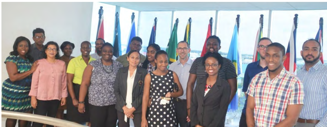
Participants at the Training Workshop on Merchandise Trade Data Processing at the CARICOM Secretariat

The Caribbean Community (CARICOM) Secretariat convened, in collaboration with the Statistical Office of the European Communities (Eurostat), a Second CARICOM Training Workshop on the Processing of Merchandise Trade Statistics Using the New Eurotrace Software from 8-11 January 2019 at the CARICOM Secretariat Headquarters in Georgetown, Guyana .